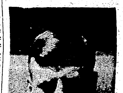
CLYDE UNDERWOOD (Nitro High)